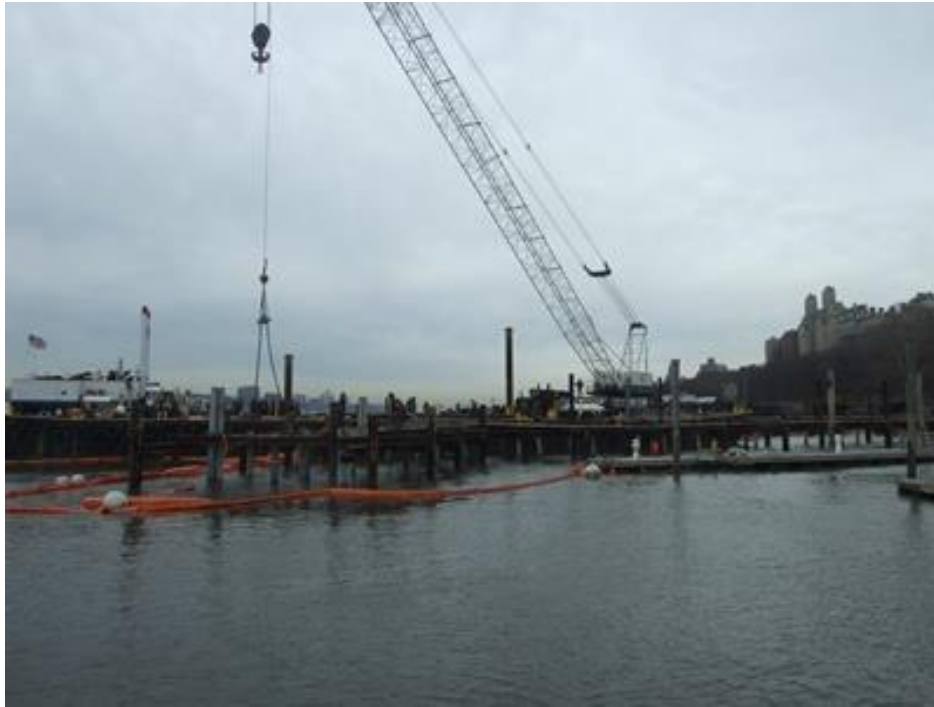
A Dock construction – December, 2015